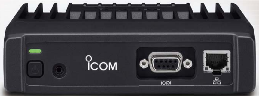
RS-232 + Ethernet Version