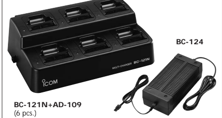
BC-121N+AD-109 (6 pcs.)