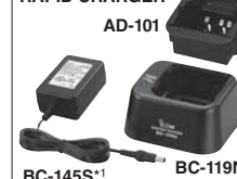
AD-101 BC-145S *1 BC-119N Charges the BP-210N in 2 hours (approx.).