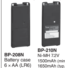
BP-208N Battery case 6 x AA (LR6) BP-210N Ni-MH 7.2V 1500mAh (min.) 1650mAh (typ.)