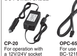
CP-20 For operation with a 12V/24V socket OPC-656 For use with BC-121N