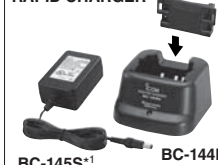
BC-145S *1 BC-144N Charges the BP-210N in 2 hours (approx.).