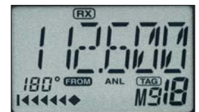
CDI mode display

The IC-A24/E has VOR navigation functions. The DVOR mode shows the radial to or from a VOR station and the CDI mode shows the course deviation to/from a VOR station. You can also input your intended radial to/from the VOR station and show the course deviation on the display. In the USA version, the duplex operation allows you to call a COM channel, while you are using VOR navigation. (* IC-A24/E only)