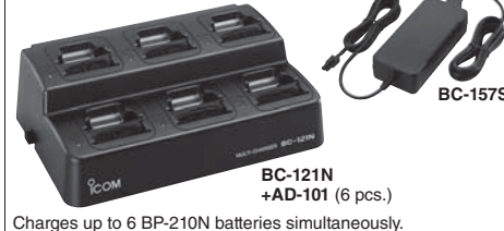
BC-121N +AD-101 (6 pcs.) Charges up to 6 BP-210N batteries simultaneously.

*1 BC-145SA for 120V AC. SE for 230V AC. SV for 240V AC. *2 BC-167SA for 120V AC. SD for 230V AC. SV for 240V AC.