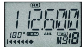
CDI mode display

The IC-A24 has VOR navigation functions. The DVOR mode shows the radial to or from a VOR station and the CDI mode shows the course deviation to/from a VOR station. You can also input your intended radial to/from the VOR station and show the course deviation on the display. In the USA version, the duplex operation allows you to call a COM channel, while you are using VOR navigation. (* IC-A24 only)