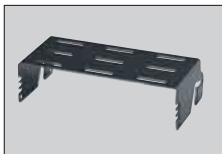
MB-118 MOBILE MOUNTING BRACKET For mounting the radio in a vehicle.