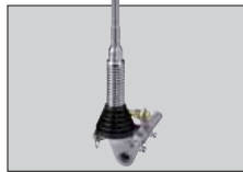
AH-2b ANTENNA ELEMENT For mobile operation with the AH-4. All bands between 7–30 MHz can be matched.