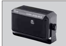
SP-10 EXTERNAL SPEAKER Compact size speaker.