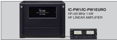
IC-PW1/IC-PW1EURO HF+50 MHz 1 kW HF LINEAR AMPLIFIER Covers all HF and 50 MHz bands, provides clean, stable 1 kW output. Automatic antenna tuner and compact detachable controller are standard. 2 exciter inputs are available. (An optional OPC-599 is required.)