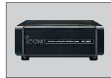
AT-180 AUTOMATIC ANTENNA TUNER Compact, light weight antenna tuner.