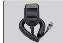
HM-36 HAND MICROPHONE Same as that supplied with the radio.