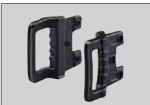
MB-116 HANDLES Protect buttons and knobs on the front panel when moving the radio.