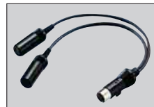
OPC-599 CABLE ADAPTER Converts 13-pin ACC connector to 7-pin + 8-pin ACC connector for connection with IC-PW1/EURO.