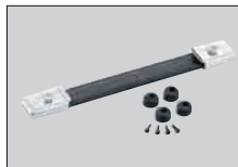
MB-117 CARRYING HANDLE Convenient when carrying the transceiver.