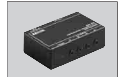
CT-17 CI-V LEVEL CONVERTER For remote transceiver control from a PC equipped with an RS-232C port.