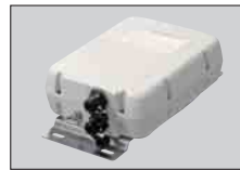
AH-4 HF+50 MHz AUTOMATIC ANTENNA TUNER Covers 3.5–30 MHz with a 7 m (23 ft) or longer wire antenna.