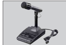
SM-20 DESKTOP MICROPHONE High quality desktop microphone. Includes [UP]/[DOWN] switches and low cut function.